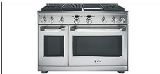
All-New 48" Monogram Range

All New GE Monogram Ranges coming in October, 2008 Plus redesigned Refrigeration on DISPLAY now!